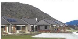
Illustration: Abbeyfield House

We are fundraising to build an Abbeyfield house to accommodate older people in independent units operating like a flat, with a live-in housekeeper who will prepare lunch and dinner daily for residents to share in a communal dining room. The houses have shown they reduce loneliness, satisfy nutritional needs and offer security and warmth. Abbeyfield homes show delayed entry to Rest homes by up to 3 years. The house is affordable with residents contributing Superannuation only. There are 14 Abbeyfield houses in NZ, ours will be the first in Hawke's Bay.